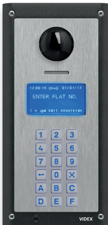
4514V with 2-module wall installation kit 4882

Thanks to SIP protocol support, Art.4514 can be connected to phones and VOIP switchboards, while standard RTSP protocol allows to transmit the video stream towards compatible devices.