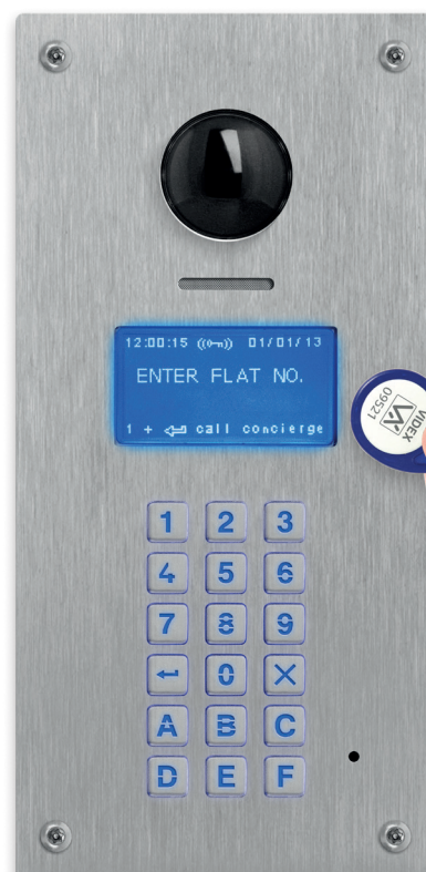
4514V/F flush installation

The 4000 series digital call panel is uniquely compact compared to the rest of the market, occupying only 2 modules.